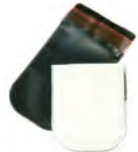
Quickshot Phosphor Plate Envelopes Latex-free. Size 1 or 2. Pack 500. XXB524 - XXB525