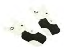
Bite Covers Sizes: 0 (20 x 30mm), 1 (20 x 40mm), 2 (30 x 40mm), 3 (27 x 54mm). Pack 200. QWU010 - QWU013