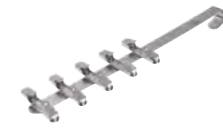
10 Hanger Autoclavable. Each. XXH010