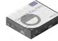
Panoramic Green Sensitive Film Pack 100. 12 x 30cm XGU170 15 x 30cm XGU171