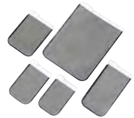
Barrier Envelopes Sizes: 0, 1, 2, 3, 4. Pack 100. QWU000 - QWU004