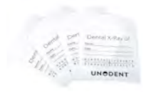
Envelopes Paper. Pack 200. XXI011