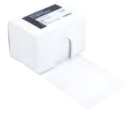
Bite Block Hygiene Sleeve 4.6 x 2.1cm or 8.0 x 4.0cm. Box 250. QWU020 - QWU021