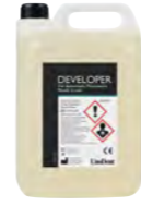
Developer Ready to use. 2 x 5L XUO010