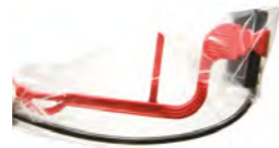
Quickshot Sensor Covers Regular or Large. Box 500. XXB520 - XXB521