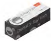
Periapical Speed Film 31 x 41mm. Box 150 Speed E XAU000 Speed F XAU010